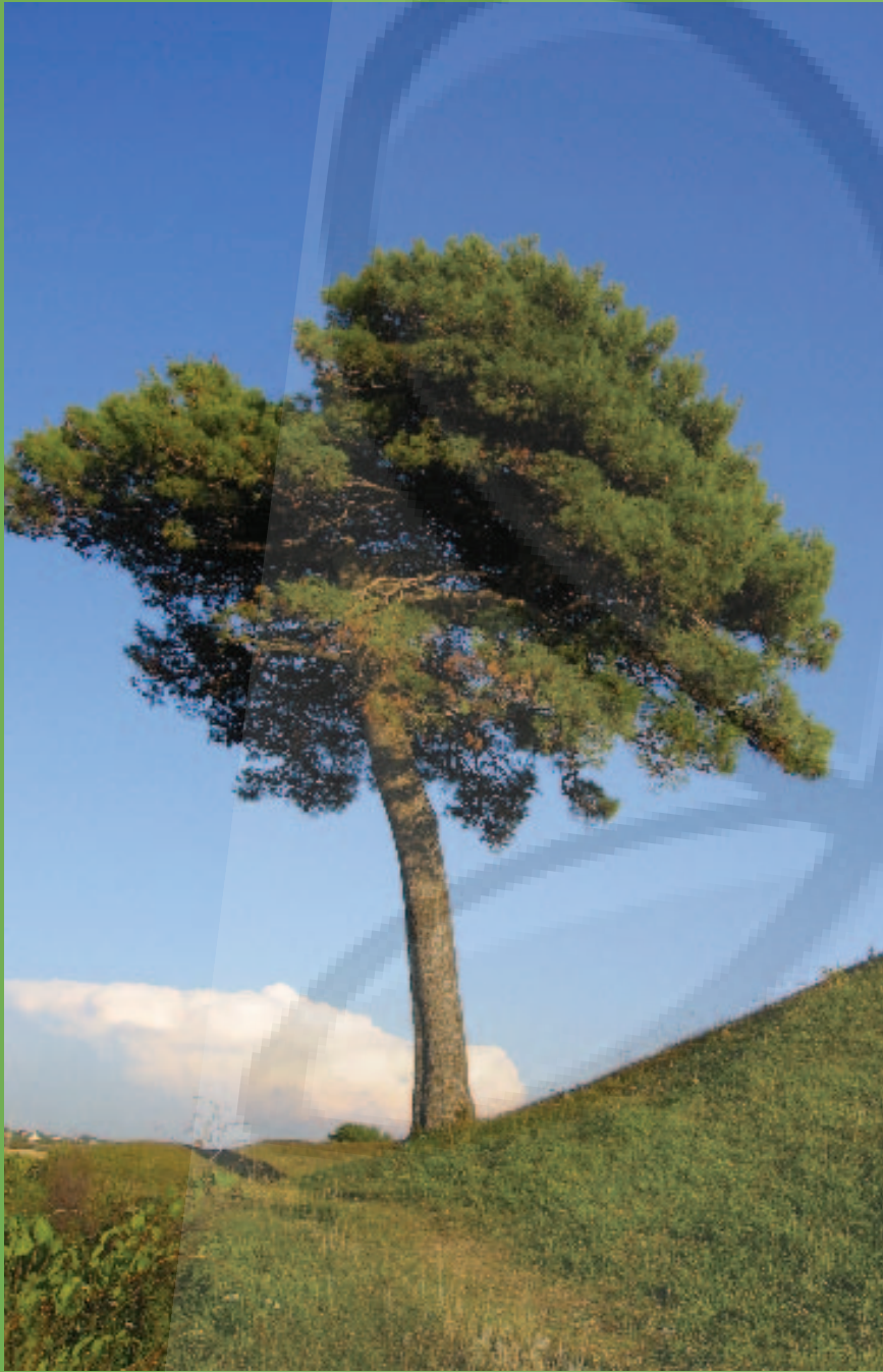
NAMC Toddlers A: Distinguishing Same from Different