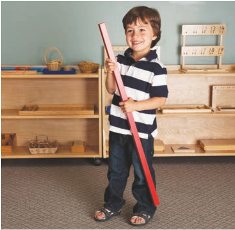
Child carrying the longest Red Rod