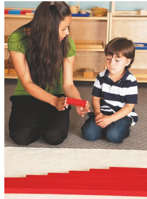
Demonstrating that the shortest rod is the difference between one rod and the next