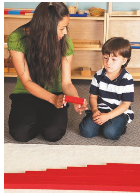
Demonstrating that the shortest rod is the difference between one rod and the next