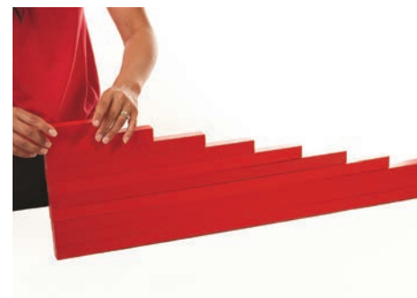
Building the long stair vertically