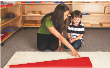
Admiring the completed stair