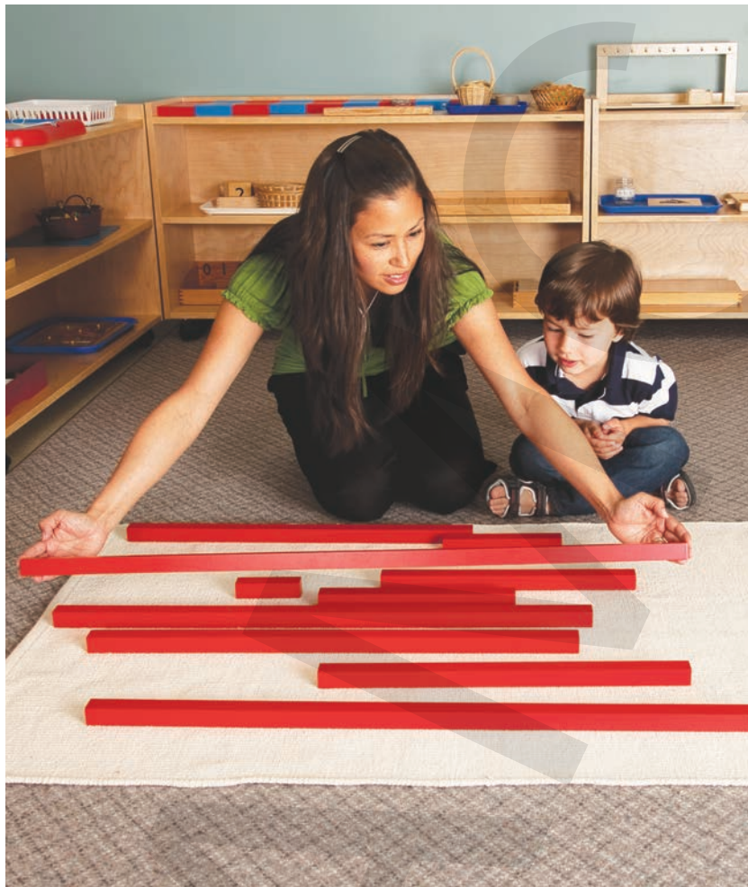
Working with the Red Rods