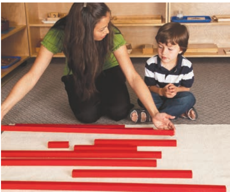
Placing the longest rod at the top of the mat

However, due to safety concerns, it is common practice today to carry the rods vertically and close to the body.