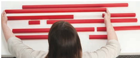
Teacher demonstrates comparing a rod against other rods