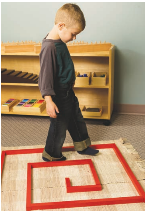
Child carefully walking in the Red Rod maze