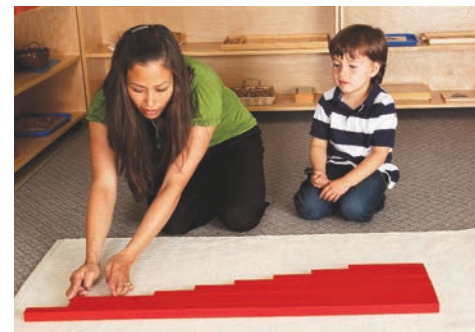
Measuring the difference between one rod and the next