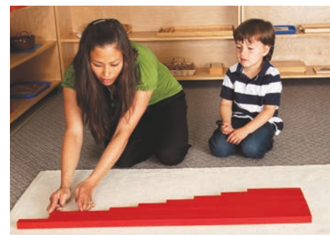
Measuring the difference between one rod and the next