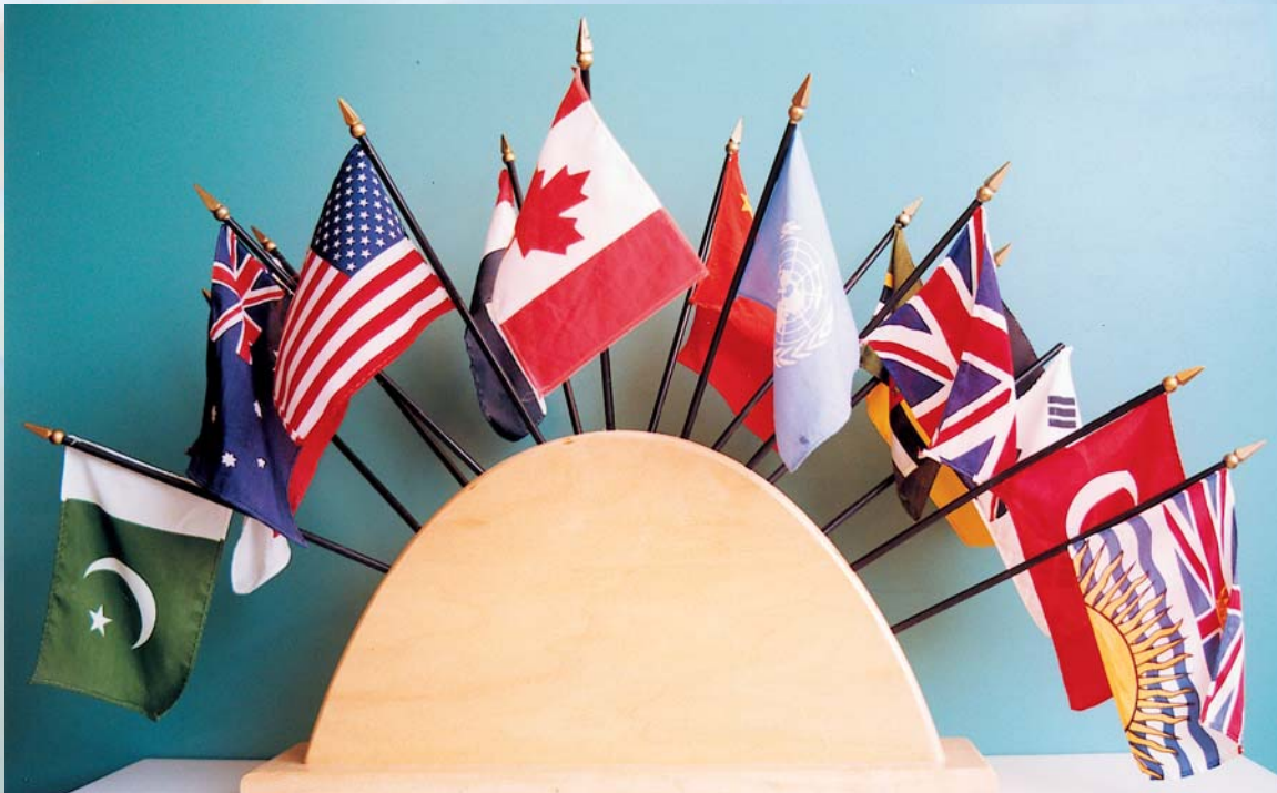
A Set of Flags Displayed on a Wooden Stand