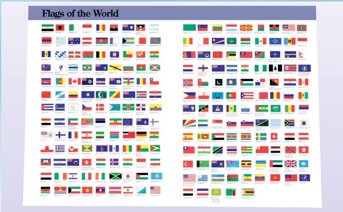
A Flag Chart of Major Countries